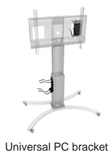
Universal PC bracket